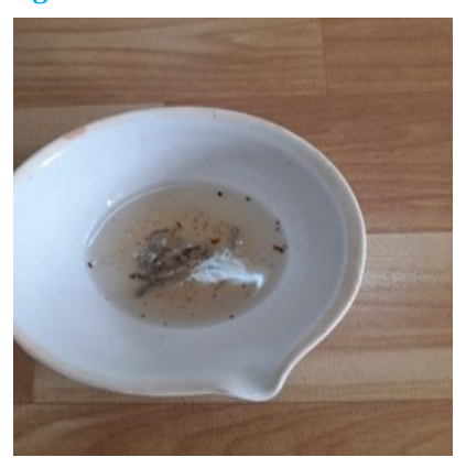
Figure No. 6: Test for Flavonoids