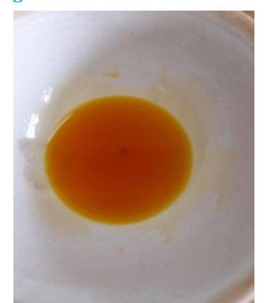
Figure No. 4: Test for Alkaloids