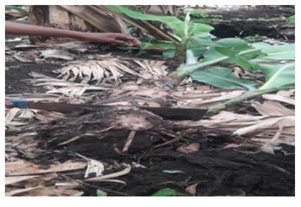
Figure No. 1: Collected Kadalikand