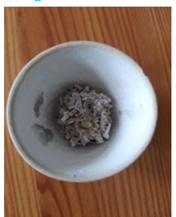
Figure No. 3: Total Ash